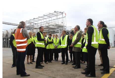
A VIP tour of Brown Brothers Milawa winery forms part of the "Regional Economy" program day.