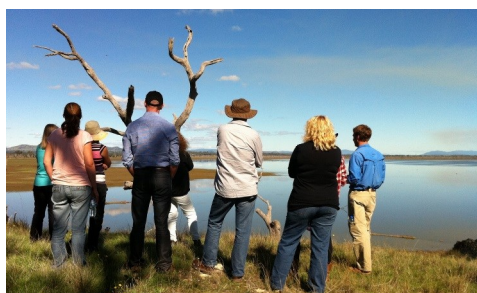
Winton Wetlands tour