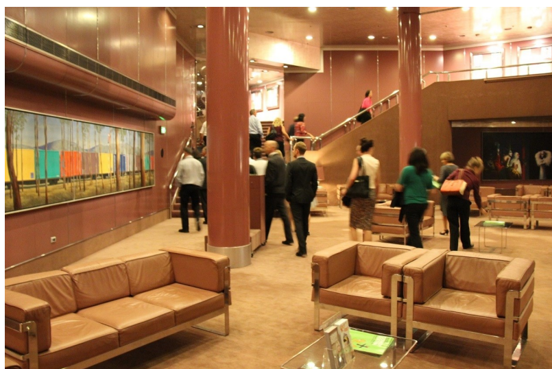
Visiting Arts Centre Melbourne