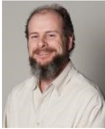
Anthony Griffiths Chair