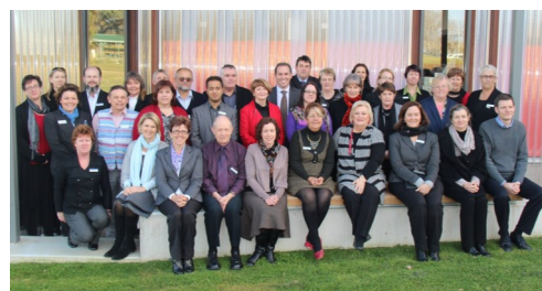
Regional CLP staff and Board members attended a Leadership Forum held in Ballarat in June